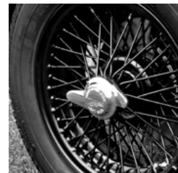
Black wire wheels