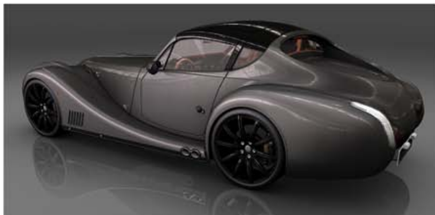
EIGER SPORT GREY