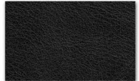
Natural distressed black