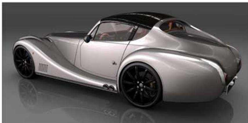
MATTERHORN SILVER (metallic)