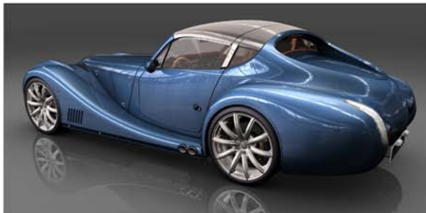
EVEREST BLUE (metallic)