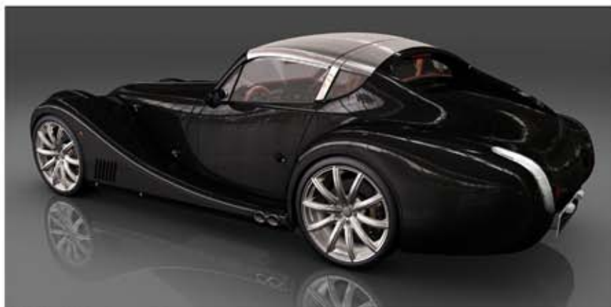
K-2 BLACK (metallic)