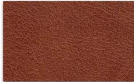
Natural distressed tan