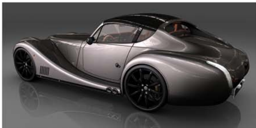
ETNA GREY (metallic)