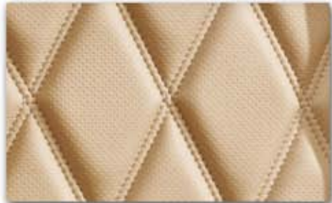
Twin stitch pleat