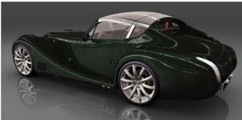
STROMBOLI GREEN (metallic)