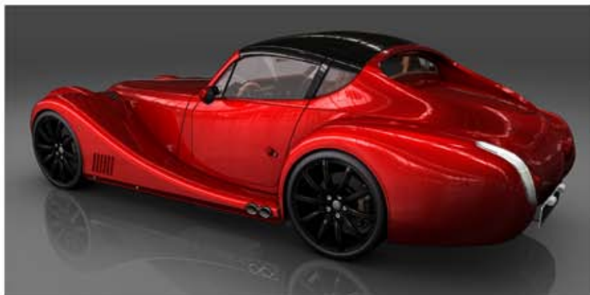
VESUVIUS RED (metallic)