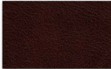
Natural distressed brown