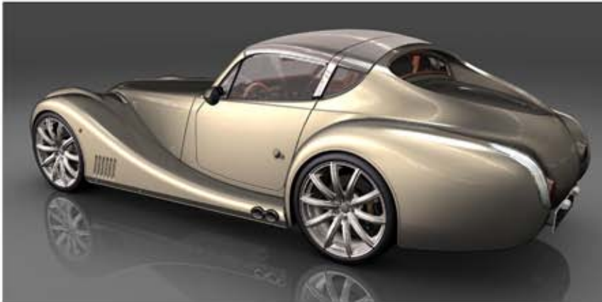
KILIMANJARO SAND (metallic)