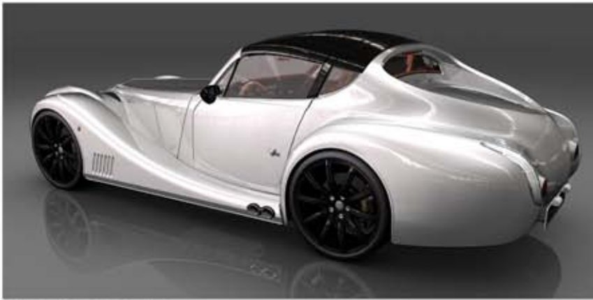
MONT BLANC WHITE